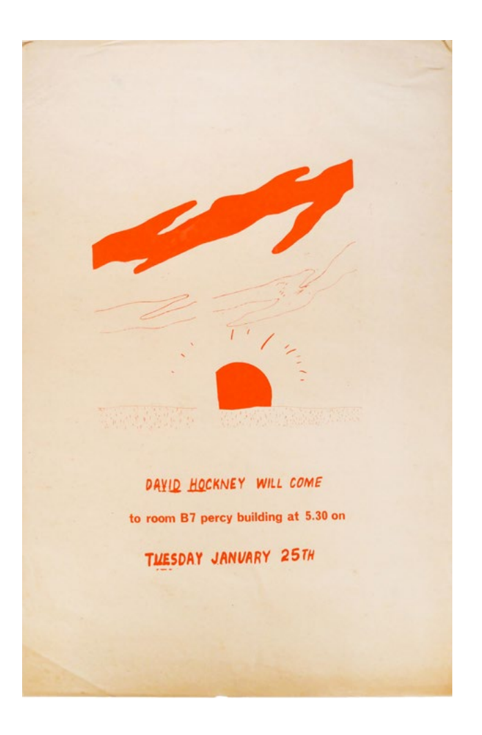
No. 3. Proof in red of the second screen; (sheet size: 570 \times 448 mm).