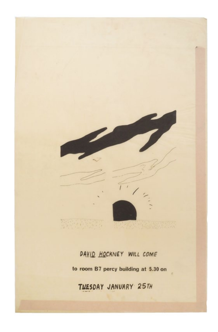
No. 1. Original drawing in black ink; (sheet size 780 × 510 mm).